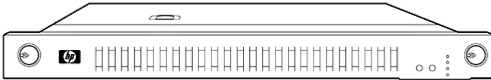
HP StorageWorks Secure Key Manager

The HP StorageWorks Secure Key Manager provides centralized key management for HP StorageWorks Enterprise Storage Libraries (ESL) E-series Tape Libraries, HP StorageWorks Enterprise Modular Library (EML) E-series Tape Libraries and the HP StorageWorks Encryption SAN Switch. In addition to the clustering capability, the Secure Key Manager provides comprehensive backup and restore functionality for keys, as well as redundant device components and active alerts. The Secure Key Manager supports policy granularity such as a key per library partition to a key per tape cartridge and allows for additional client types in the future needing key management services. Keep your confidential data secure yet highly available with automated management for your encryption keys using the HP Secure Key Manager, a member of the "HP Secure Advantage" portfolio.