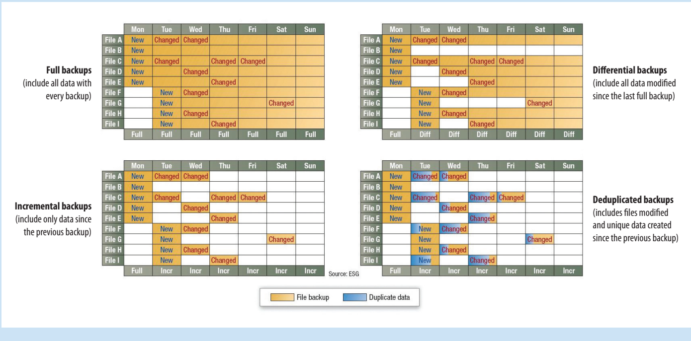
Figure 1: How various backup methods measure up

For maximum manageability, the solution should allow for granular (tape- or group-level) policy-based deduplication based on a variety of factors: resource utilization, production schedules, time since creation, and so on. In this way, storage efficiencies can be achieved while optimizing the use of system resources.